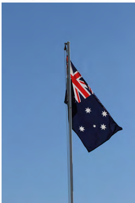
ANZAC Day at Watts Bridge