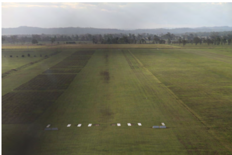
The new threshold markers for 12R (12April)