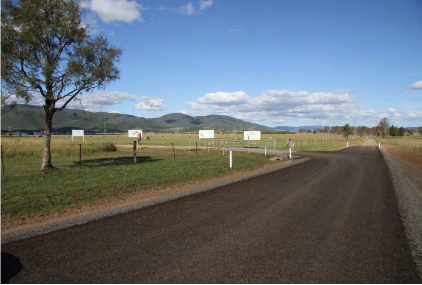
The recently sealed access road to the Watts Bridge entrance.