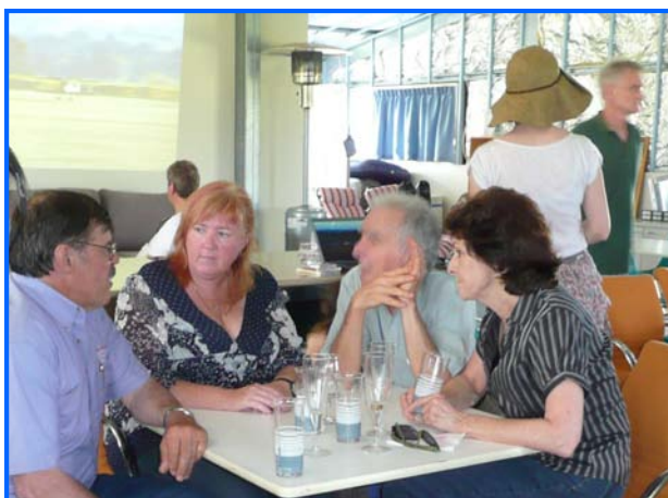
Making new friends