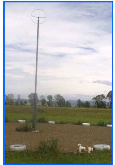
Volunteer searching for missing Windsock