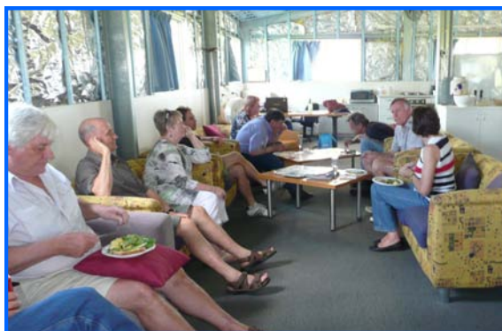
President gives his approval to delicious barbecue