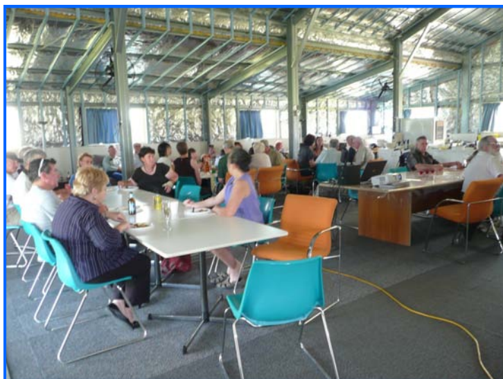
Enjoying the AGM Barbecue