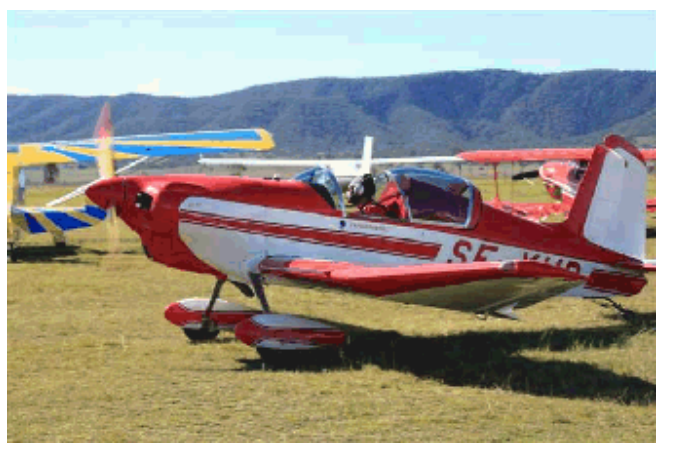
Wheeling 'em out on a nice day for Aerobatics at Watts