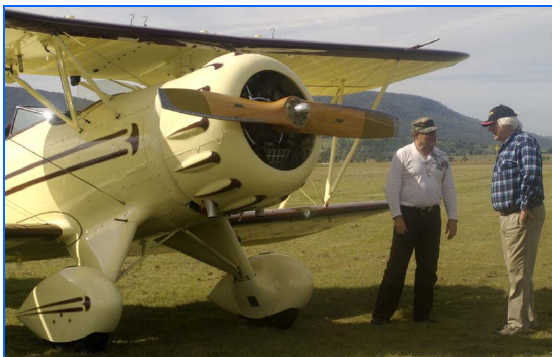
Pictured above is this Waco biplane based at Caloundra The operator intends setting up an “up market “ joy flight business catering for weddings anniversaries and other special occasions. The Waco was refuelling while on a special mothers day flight.